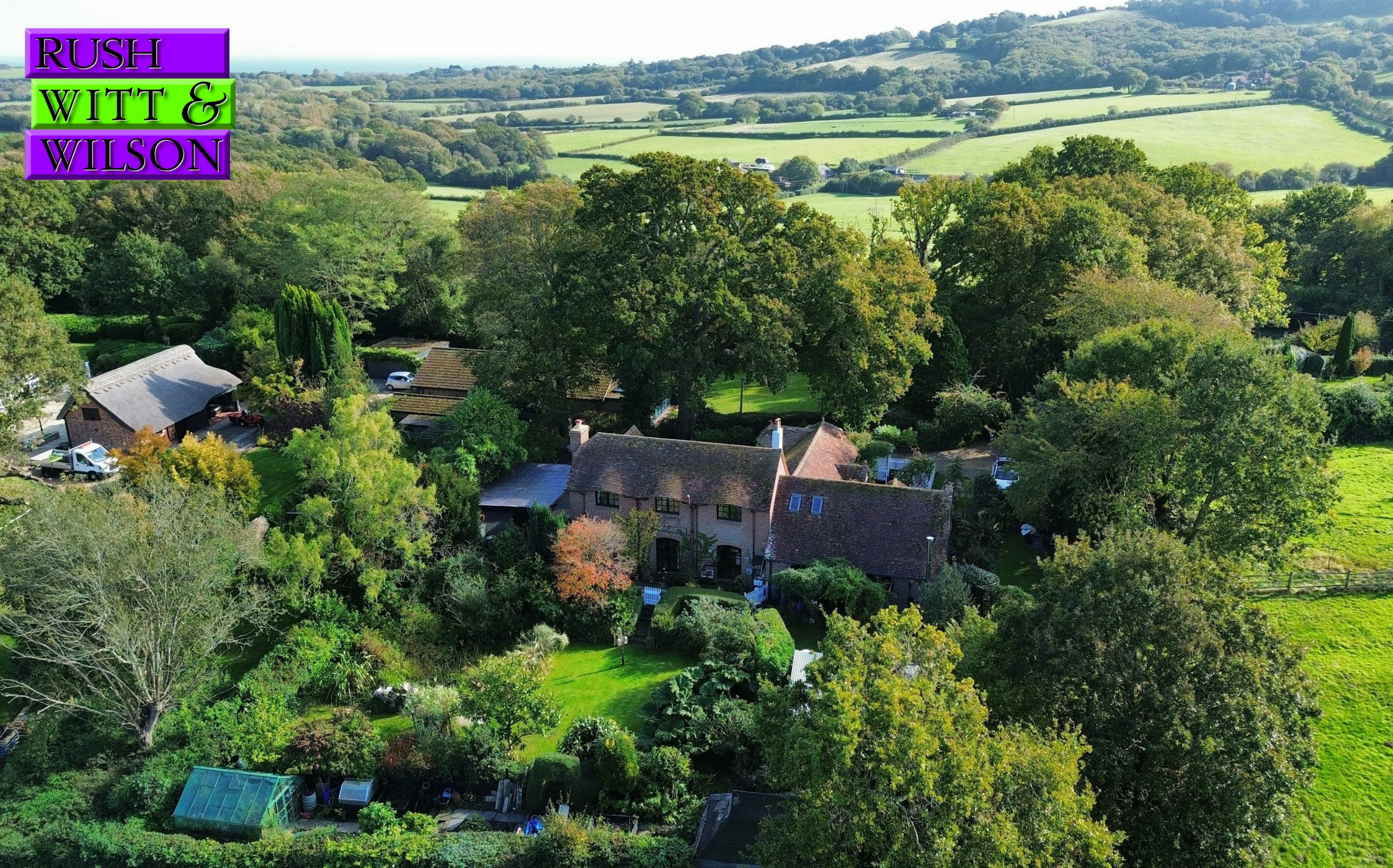
Friars Hill Cottage Friars Hill, Guestling, East Sussex TN35 4ET Guide Price £800,000 - £825,000 Freehold